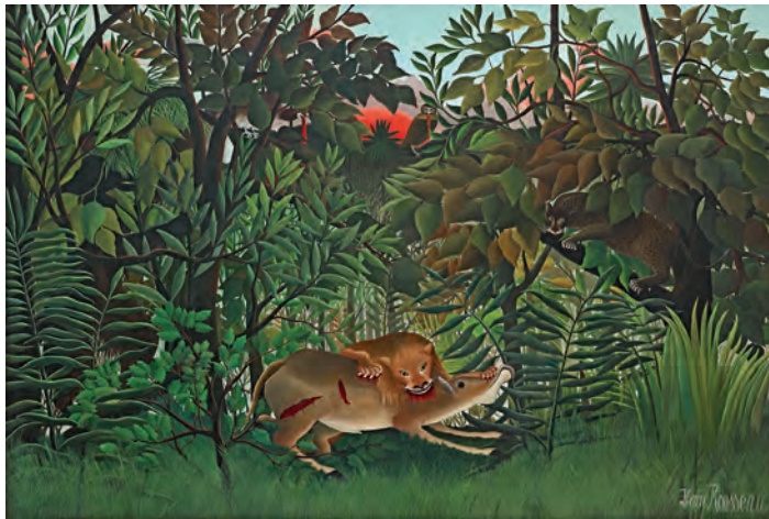
01 Henri Rousseau The Hungry Lion Attacking an Antelope , 1898/1905 Oil on canvas, 200.0 x 301.0 cm Fondation Beyeler, Riehen/Basel, Beyeler Collection