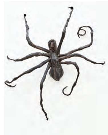
02 Louise Bourgeois SPIDER IV, 1996 Steel, 198.0 x 175.0 x 53.3 cm Private Collection, New York