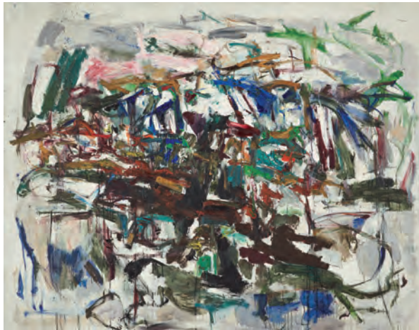
03 Joan Mitchell Untitled, 1957 Oil on canvas, 226.1 x 288.3 cm Private Collection © The Joan Mitchell Foundation Inc., New York