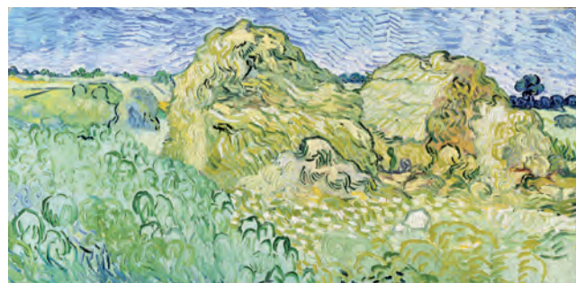
06 Vincent van Gogh Field with Stacks of Grain , 1890 Oil on canvas, 50.0 x 100.0 cm Fondation Beyeler, Riehen/Basel, Beyeler Collection

Press images: www.fondationbeyeler.ch/en/media/press-images