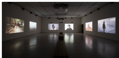
8. Installation view / Espace Projet Anne RoCHAT. In Corpore (Manor Vaud Culture Prize 2020)