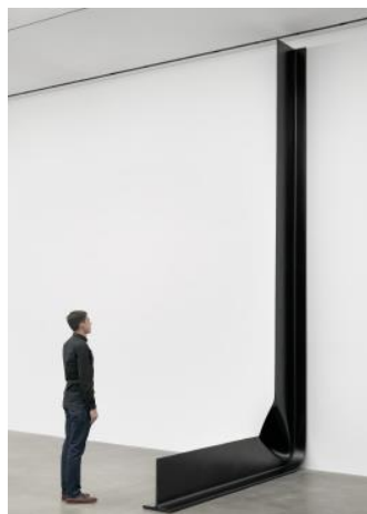
Monika Sosnowska, 'T' (2017), installation view 'Monika Sosnowska. Structural Exercises', Hauser & Wirth London, 2017, Photo Alex Delfanne, © Monika Sosnowska, Courtesy of the artist and Hauser & Wirth