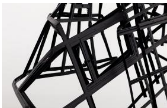
Monika Sosnowska, 'Facade' (2013), Detail, © Monika Sosnowska, Courtesy of the artist and Museum of Modern Art, Warsaw