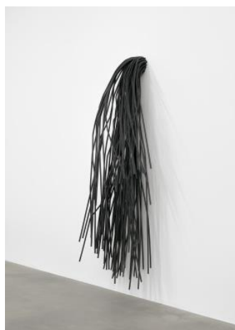
Monika Sosnowska, 'Rebar 16', installation view 'Monika Sosnowska. Structural Exercises', Hauser & Wirth London, 2017, Photo Alex Delfanne, © Monika Sosnowska, Courtesy of the artist and Hauser & Wirth