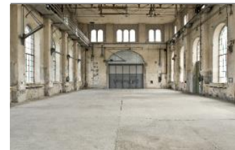
Kunstraum Dornbirn