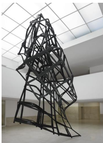
Monika Sosnowska, 'Facade' (2013), installation view ACCA Melbourne, 2013, © Monika Sosnowska, Courtesy of the artist and Museum of Modern Art Warsaw, Photo Andrew Curtis