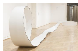
Monika Sosnowska, 'Pipe' (2020), installation view Zachęta National Gallery of Art, Warsaw, 2020, Photo Piotr Bekas/Zachęta archive, © Monika Sosnowska, Courtesy the artist and Foksal Gallery Foundation, Warsaw