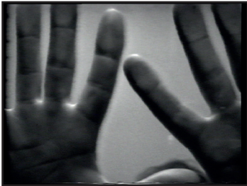
5. René Bauermeister Support-Surface , 1969 Video, b/w, sound, 12' Collection du Fonds d'art contemporain de la Ville de Genève (FMAC) Video Still