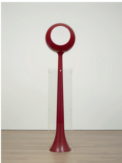
1. René Bauermeister Sphère tournante , 1968 Polyester and Plexiglas 210 x 38 x 38 cm Musée cantonal des Beaux-Arts of Lausanne. Gift of the artist, 1976.

Other indications (dimensions, techniques, etc.) are welcome but not obligatory. Once the document is published, we would be grateful if a copy was sent to the museum's press department: Service de presse, Musée cantonal des Beaux-Arts, Lausanne.