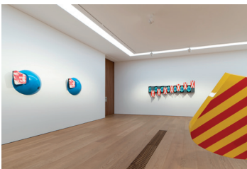
6. Gallery view / Espace Focus René Bauermeister. California Dreaming