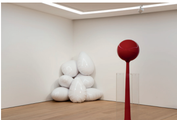
7. Gallery view / Espace Focus René Bauermeister. California Dreaming