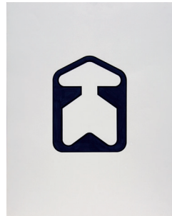
3. René Bauermeister Untitled , undated Ink and felt-tip pen on paper 55.5 x 44.2 cm Collection of the Musée des beaux-arts of La Chaux-de-Fonds. Fonds René Bauermeister